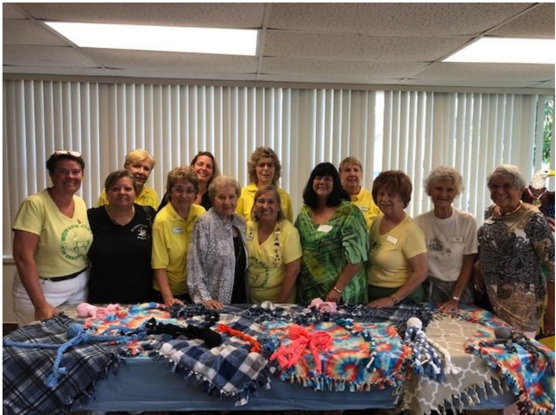
Club members pictured with our Dog blankets and toys at the District 13 Spring Workshop.